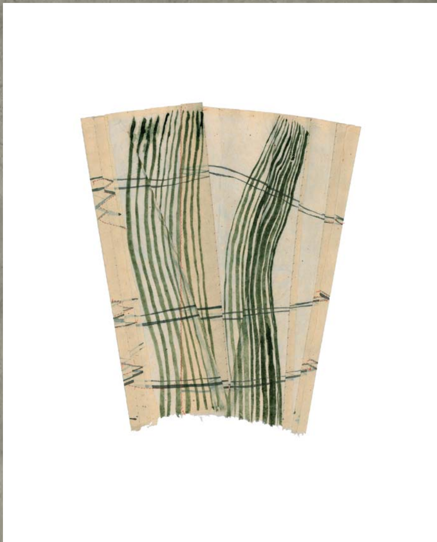
some women's apparel (from McMillan's inventory) 2011 digital print in edition of five 103 x 88 cm