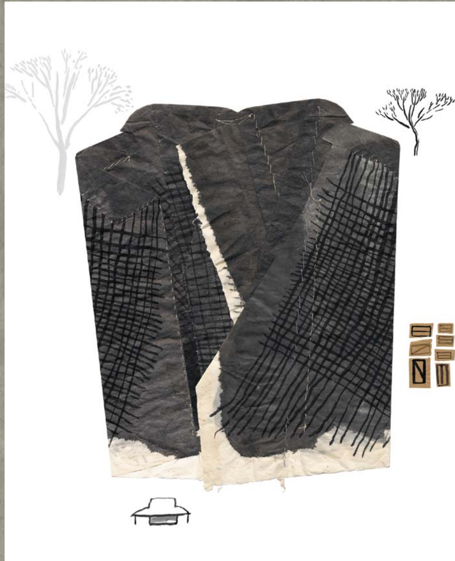
McMillan's waistcoat 2011 digital print in edition of five 104 x 84 cm