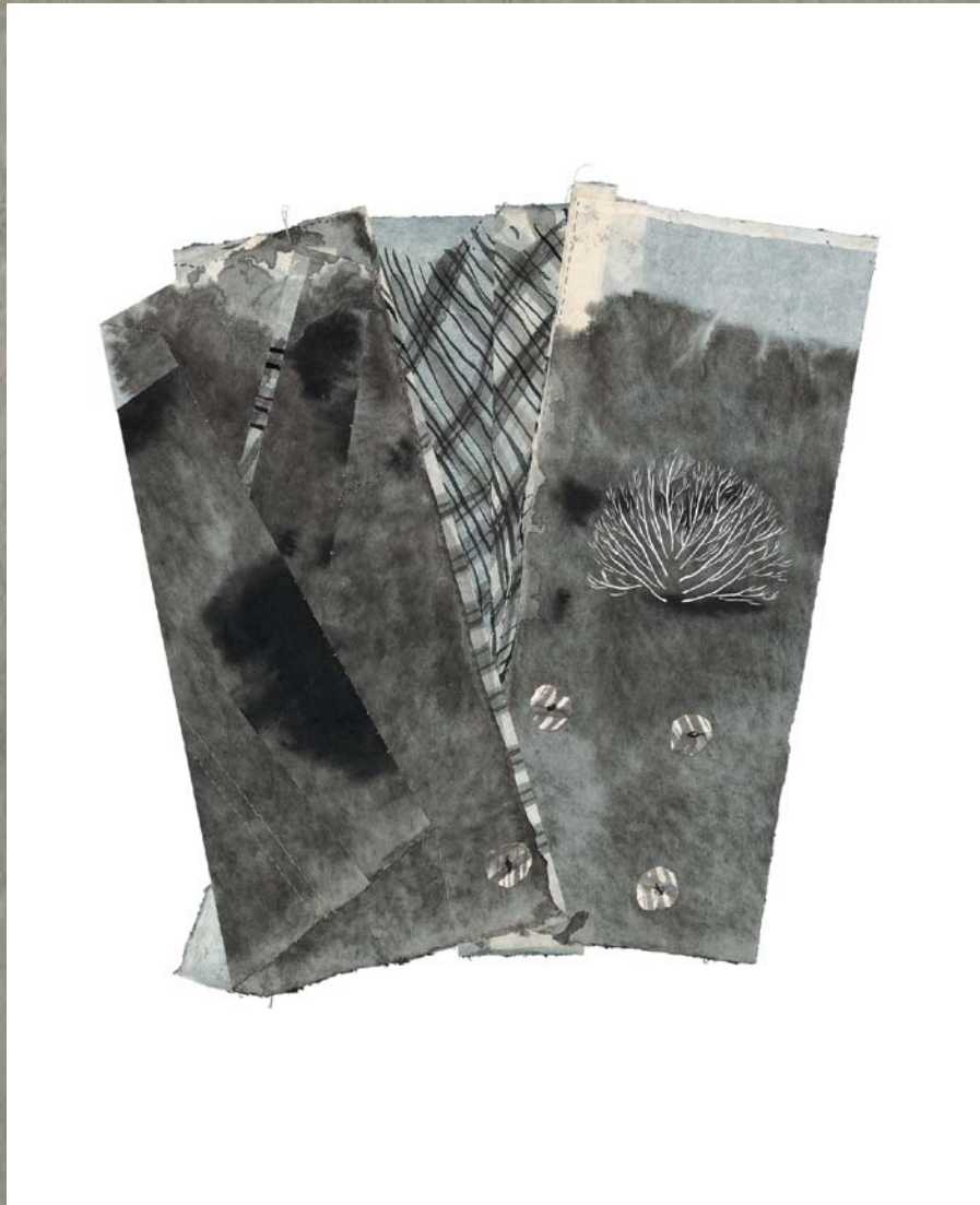
two pea-jackets (from McMillan's inventory) 2011 digital print in edition of five 108 x 88 cm